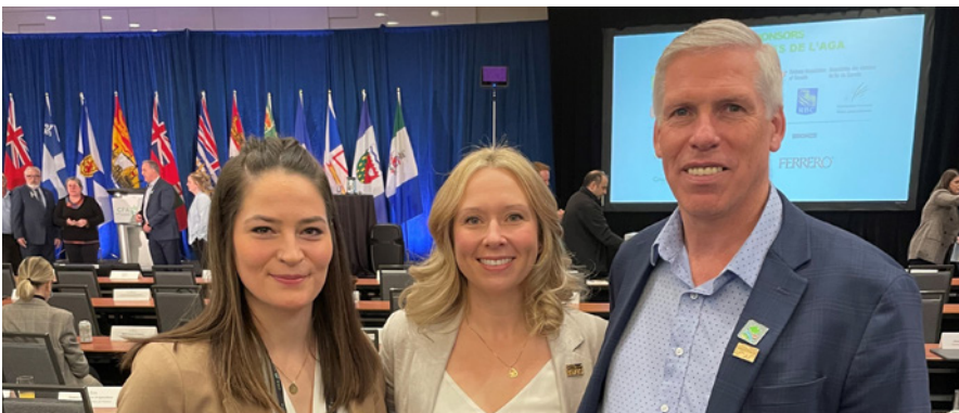
Canadian Federation of Agriculture (CFA) AGM