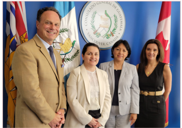
WALI staff meeting with the Consul General of Guatemala

Digital housing inspections implemented: The new housing inspection report system was launched in August. This process is improving the consistency of inspections between inspectors, has reduced staff administration time and is allowing improved information collection. Housing photographs are uploaded in real-time and can be shared with regulatory agencies as needed. Service Canada and the BC Ministry of Health have expressed support and appreciation for the improvements to this process implemented by WALI.