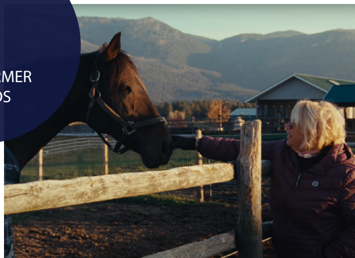
New video with Stride Away Thoroughbreds in Armstrong, B.C.