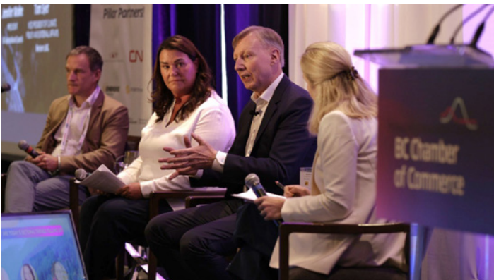
Panel participants at the BC Chamber of Commerce AGM