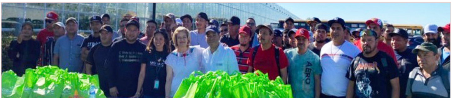
Celebrating Mexican Independence Day with workers at Village Farms