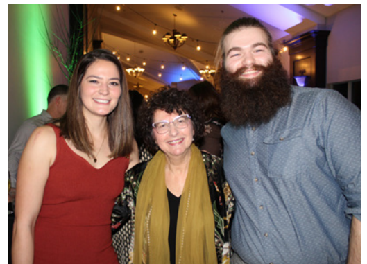
BC Agri-Food Industry Gala (Ag Gala)