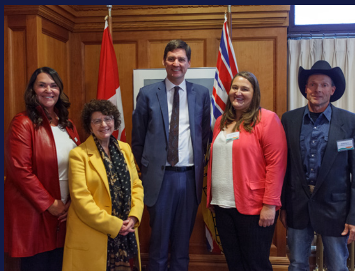
Meeting with Premier David Eby to discuss water security and storage and cost of production

60+ farmers, ranchers & agriculture leaders