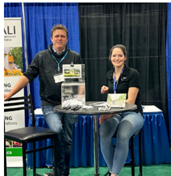
Pacific Agriculture Show