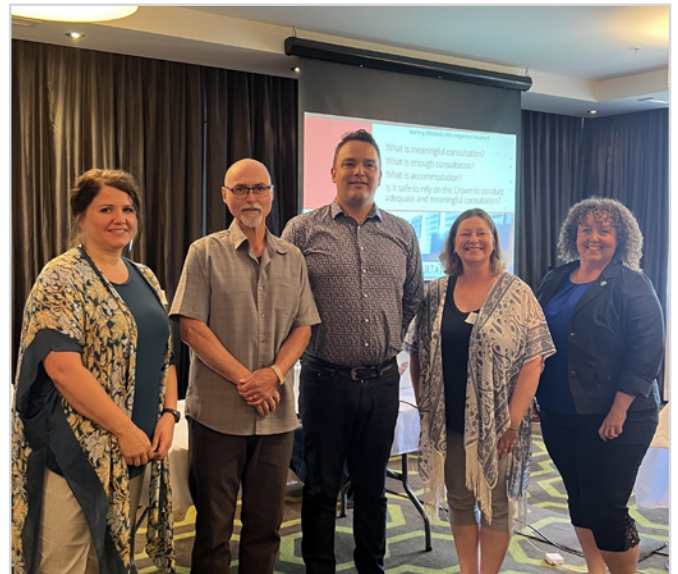
BCAC hosted several Indigenous relations training workshops.

Since that meeting, a lot has happened. Our relationship-building efforts with the new Minister and the team at the Ministry of Agriculture and Food (along with other ministries as a result) have gone extremely well. BCAC is seen as the "go-to" organization for nearly all cross-commodity consultation needs.