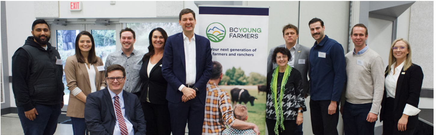
BC Young Farmers Farm Fest Event in November