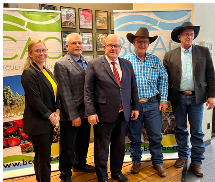
Meeting with Hon. Lawrence MacAulay at BCAC's office