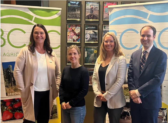
Meeting with federal Deputy Minister Stephanie Beck