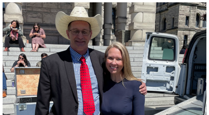
Attending BC Beef Day in Victoria