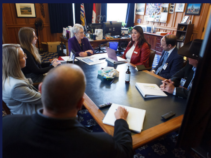
Meeting with Hon. Katrine Conroy, Minister of Finance